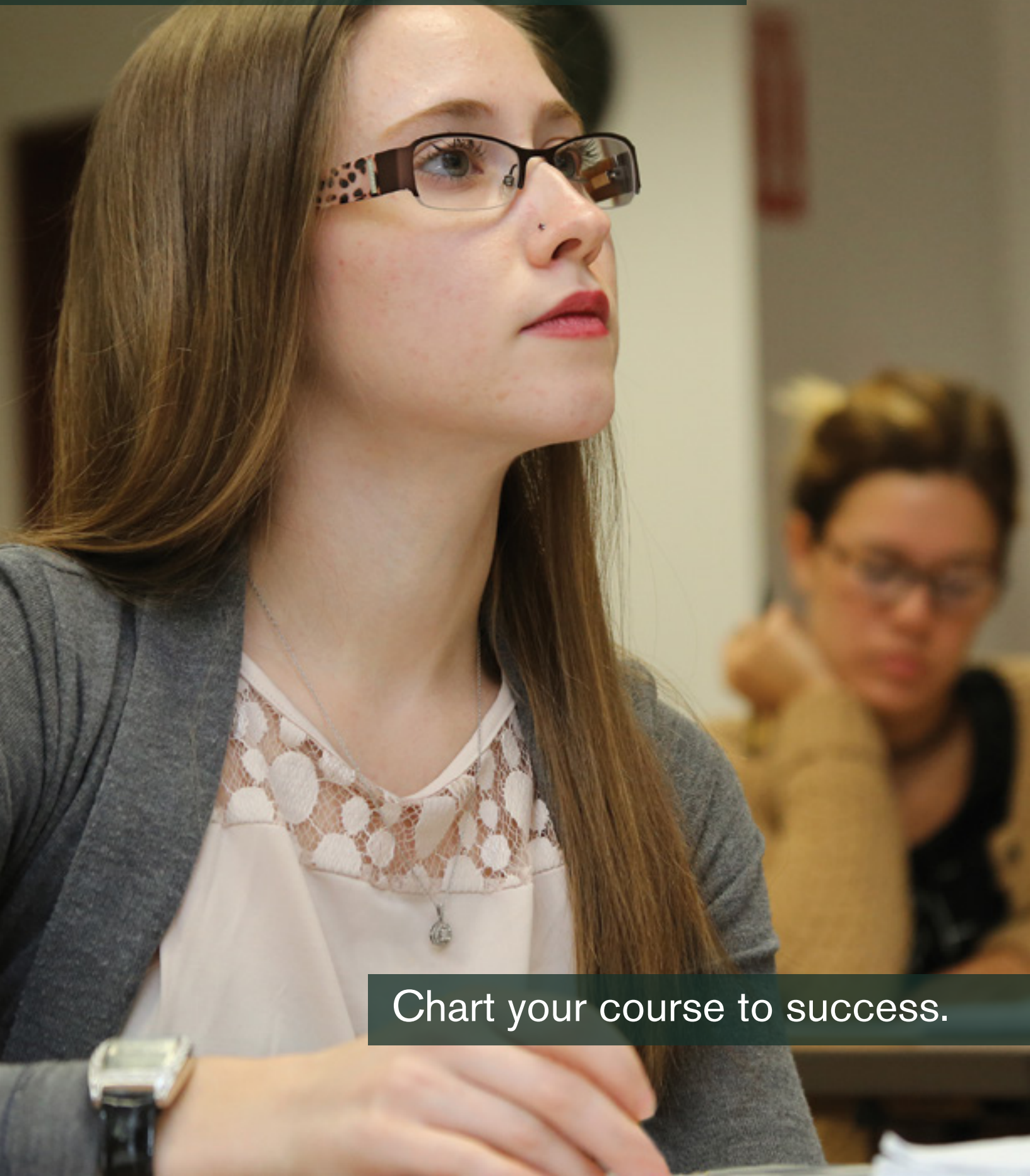
Chart your course to success.