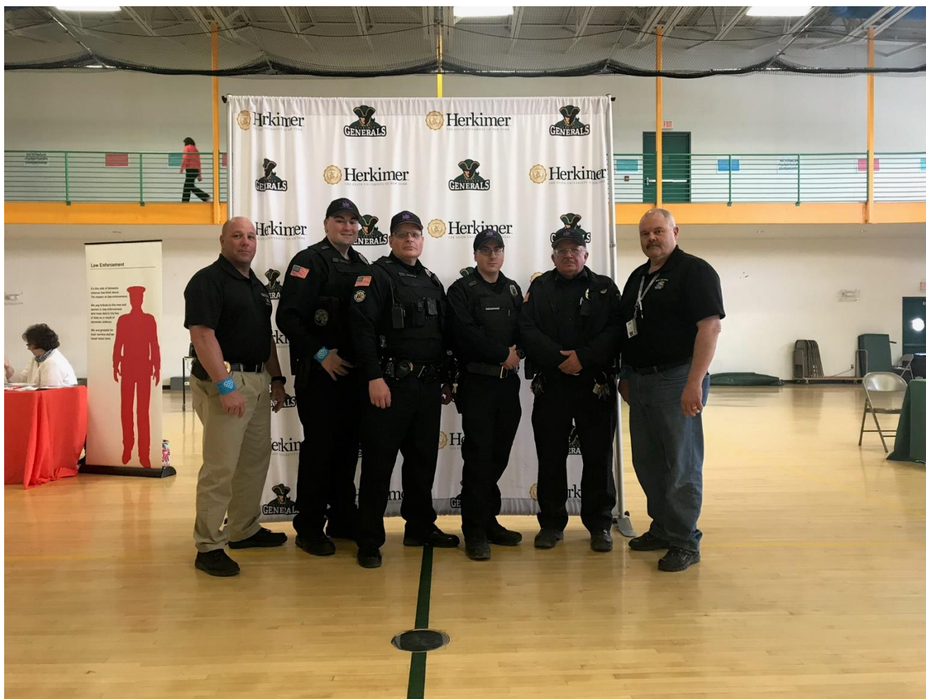
Above Campus Safety Participants in the One Love Yards for Yeardeley

violation of the Family Educational Rights and Privacy Act (FERPA) . For the purpose of this paragraph, the outcome of a disciplinary proceeding means only the institution's final determination with respect to the alleged sex offense and any sanction that is imposed against the accused.